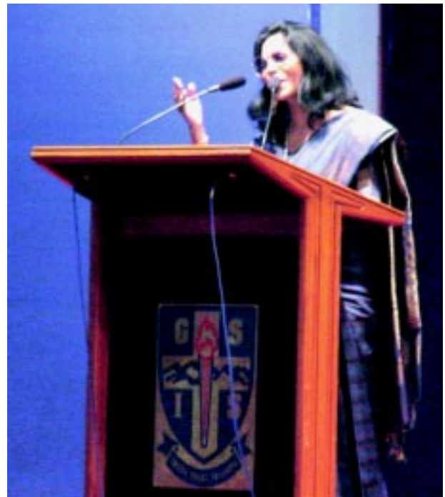
The Chief Guest Ms. Shovana Traxl Narayan delivering her address