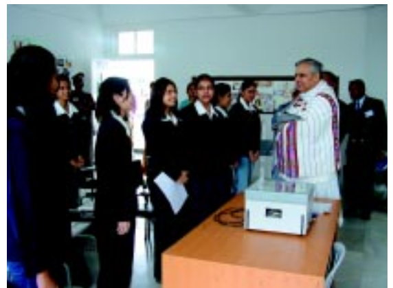
His Excellency interacting with the GSFS students