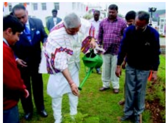
His Excellency watering a newly planted sapling

I divide education into two parameters: one is training and the other is the development of individuals. Training further has three components, one is acquisition of knowledge, the second is upgradation of skills, and the third is developing a positive mental attitude. These are the aspects of training which teachers or others can help you, and you can also learn on your own. Then comes the development aspect of every individual. Development also has four components, the first is increase of IQ - Intelligence Quotient, the second is increase of PQ - Physical Quotient, the third is increase of EQ - Emotional Quotient and the last is increase of MQ - Moral Quotient. When I talk about IQ - Intelligence Quotient, it relates to your wisdom. The school can give you any amount of knowledge, it can give any amount of skills, it can develop your positive mental attitude, but nobody can give you wisdom. Wisdom is your own acquisition over a period of time and what is wisdom? Successful implementation of all these things to achieve results for you, for your society, for your nation and when you come out successful, the world will call you a wise person.