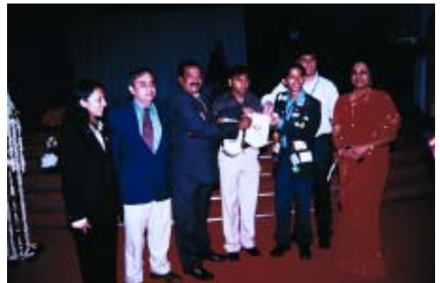
The Exchange of the Rotary Flags