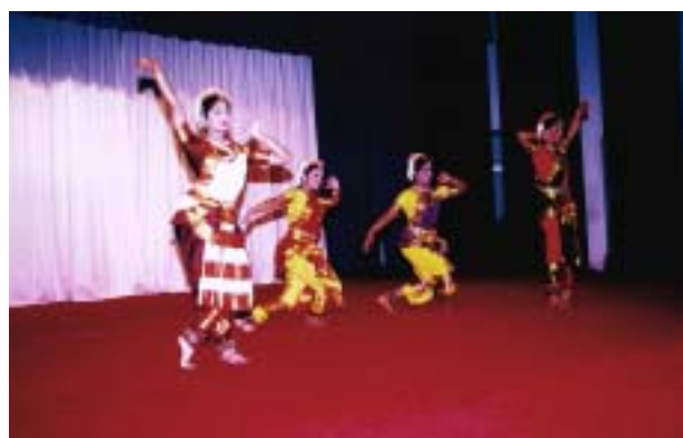
Welcome Dance performed by the Interactors of the Good Shepherd International School