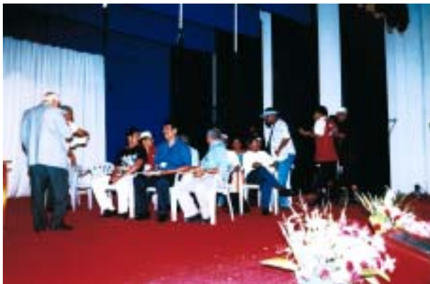
Glimpses from the Play staged by the Faculty