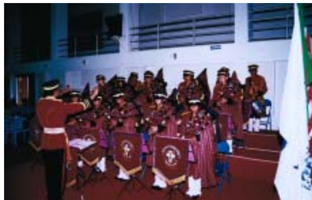
The live rendition of the National Anthems of the RI Zone VI Countries by the Brass and the Pipe Bands of Good Shepherd International School