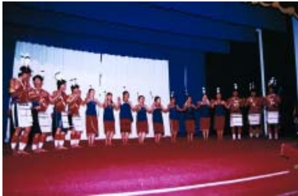
The Naga Dance performed by the Rylarians of Nagaland