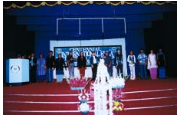
The Valedictory Song by the Rylarians from Akola, Maharashtra