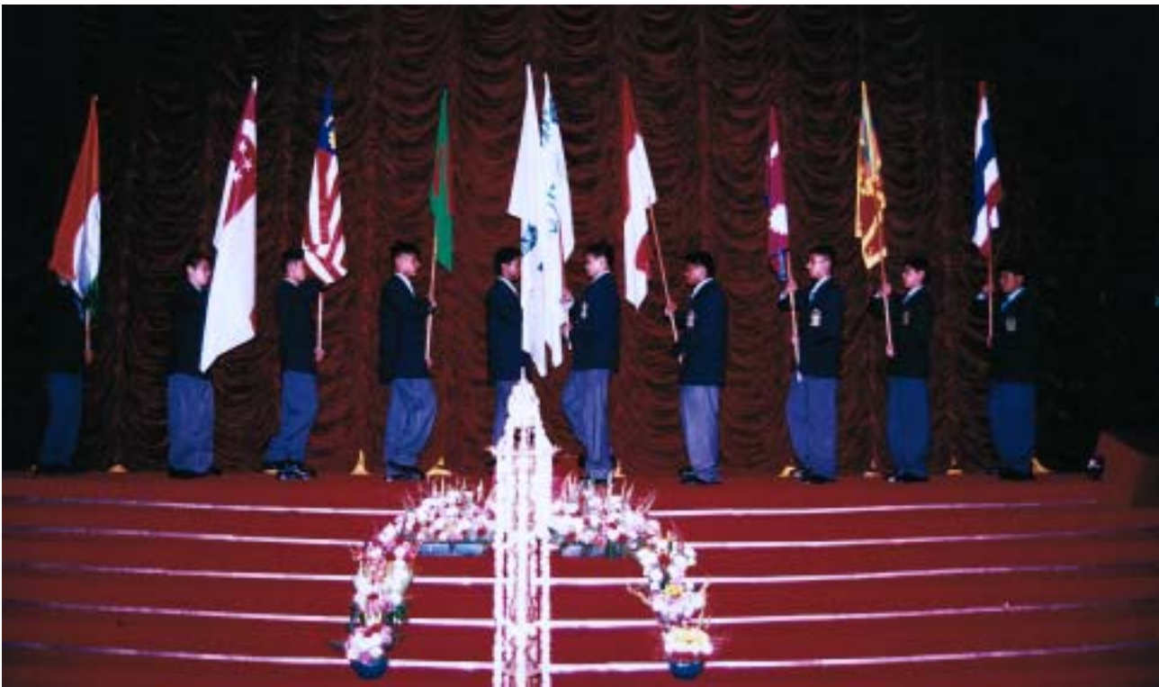
The Flag March of Rotary International Zone VI Countries

shows which not only provided a means of entertainment for the delegates (the Rylarians) but also provided a platform for many a leader to practise the leadership skills imbibed through the day.